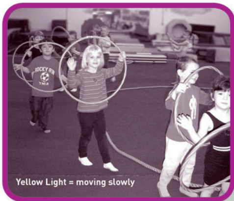
Yellow Light = moving slowly

In order to not confuse the kids, only select 4-8 of the commands below. Teach them the command word and the associated movement response. When you draw up your list of favorite commands, be sure to include the command "Freeway" often so that running will be a plentiful activity.