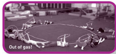
Out of gas!

"Out of gas" = fall to floor face up, both legs up