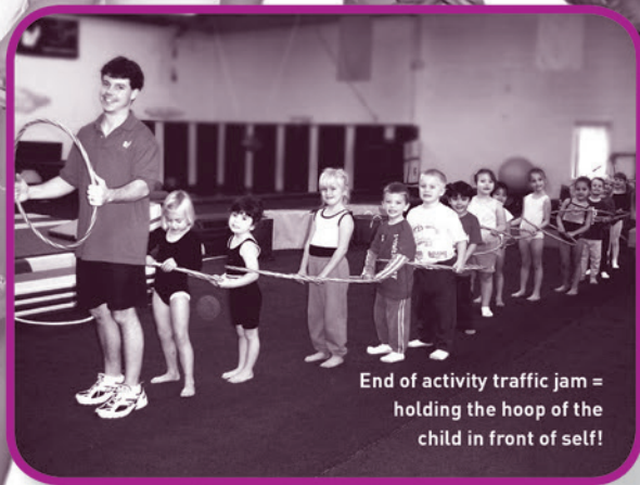
End of activity traffic jam = holding the hoop of the child in front of self!